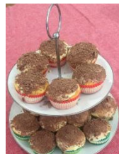
Choc orange cupcakes