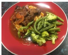
Lamb rosemary red wine casserole