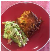
Beef lasagne & toss salad